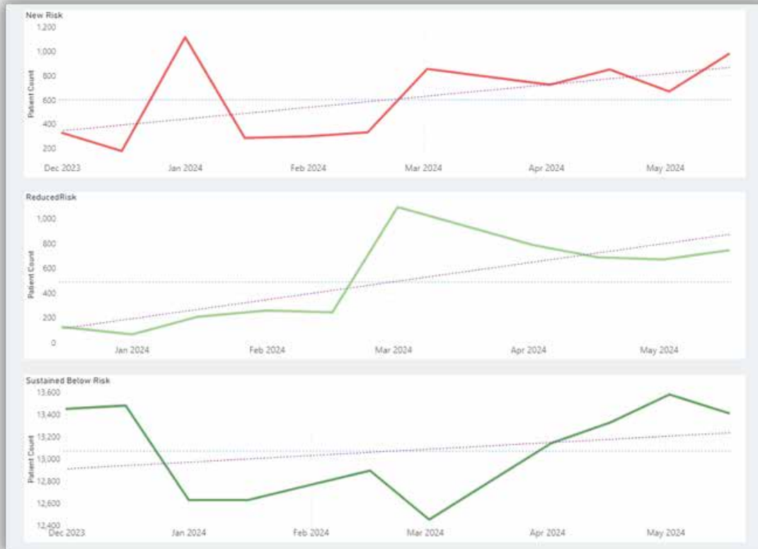
Image: Medical management views to monitor hospitalization potential and patient risk types. Note, this image does not contain PHI and is representative of what is currently in use. All data used is synthetic data.

For example, the AI solution identified key team members who required additional training to maximize the solution's optimal potential, resulting in improved clinic efficiency and patient care.